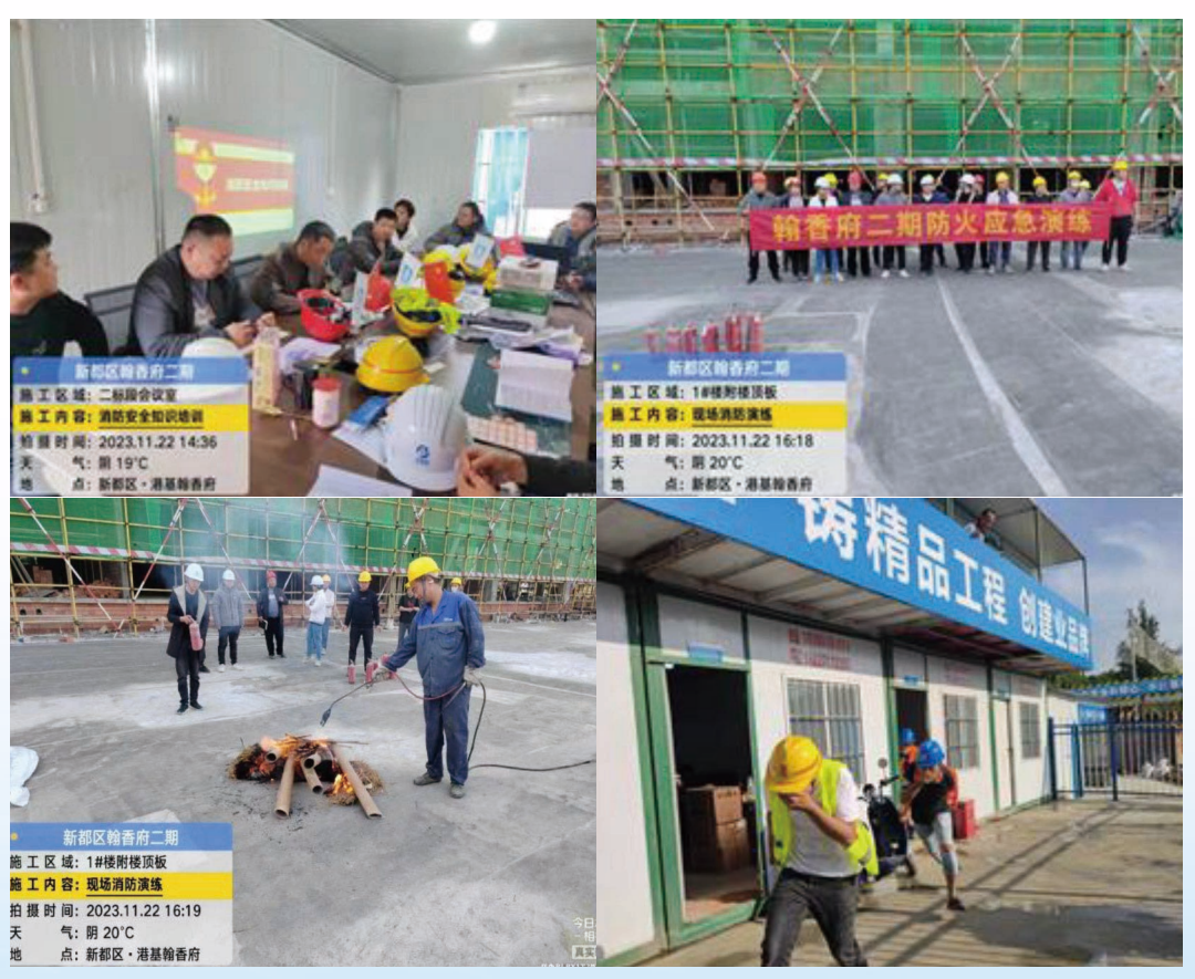
Fire emergency training

To effectively respond to potential emergencies, the Group has implemented a comprehensive system of emergency training, including fire and flood prevention training. These trainings are designed to familiarize personnel with their roles and responsibilities during emergencies and ensure they are well-prepared to execute the evacuation plan when necessary.