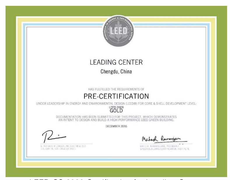
LEED-CS 2009 Certification for Leading Center

The Group's Leading Center in Chengdu of the PRC has obtained the gold level of LEED-CS 2009 system pre-certification as its overall planning, design and construction level have fulfilled the rating standards of LEED-CS 2009 under The U.S. Green Building Council in the assessment of seven aspects, including sustainable sites, water efficiency, energy and atmosphere, materials and resources, indoor environmental quality, innovation in design and regional priority. To promote sustainable transportation, the Leading Center provides a garage for bicycles and charging stations for electric vehicles, as well as expands the area for plantings by reducing parking space as far as possible. For resource conservation, we aim to save 30% of water consumption and around 15% of energy consumption by purchasing efficient sanitary wares and electrical appliances. The glass curtain walls have also been adopted to make full use of sunlight. We also select suppliers which are geographically near the constructions to reduce carbon footprints during transportation.