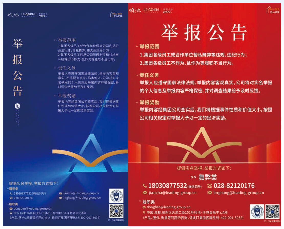
Poster about reporting corruption